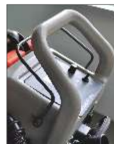
Pad holder available as option