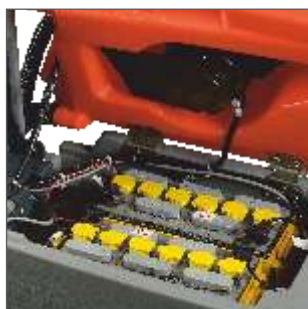
Large capacity battery pack