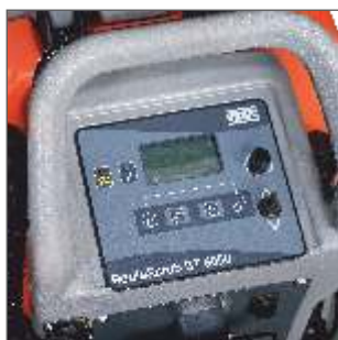
Ergonomic handle for operators of any height. Excellent view of the area to be cleaned. Soft touch buttons for selection of operation. LCD panel with display of hour meter, battery level.