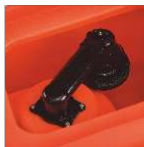
Easy tank cleaning, thanks to the large tank opening. Tank can be emptied quickly and easily via the large outlet hose. Overflow protection for the dirty water tank.