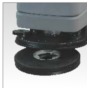
Brushes can be changed quickly without the need of any tools at the push of a button.