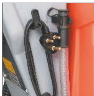
Comes with onboard charger as standard. Can be charged at any available plug socket.